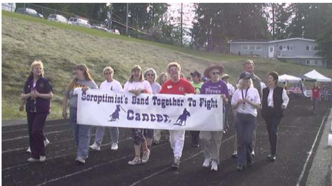
Members of SI Sequim and the two Port Angeles Soroptimist clubs band together to fight Cancer