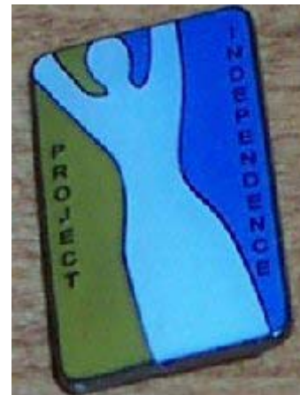
Project Independence Women Survivors of War Pin