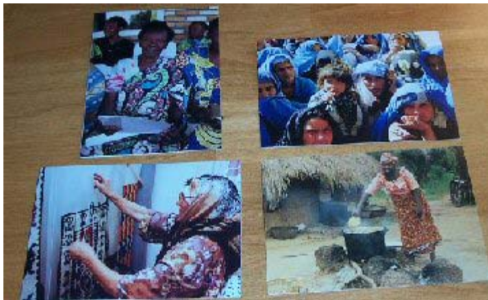
Project Independence Women Survivors of War Note Cards

100% of the proceeds from your purchases will be forwarded to SIA HQ for this project. Everyone is encouraged to join in this important Quadrennial Project.